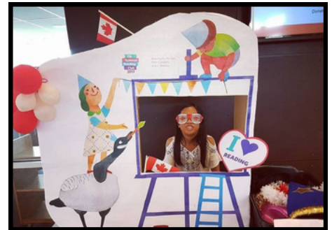
Above: The Toronto Public Library Branches in the Don Valley East offer fun and rewarding summer programming for all ages.

Other programming can be found at www.torontopubliclibrary.ca/search .